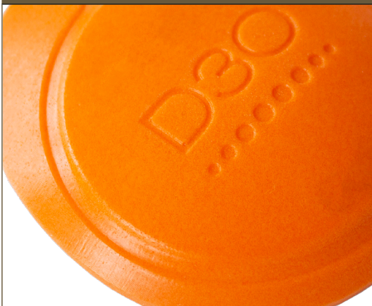
UNCHANGED COVERAGE AREA ALLOWS SIMPLE INTEGRATION INTO EXISTING BOOT RANGES