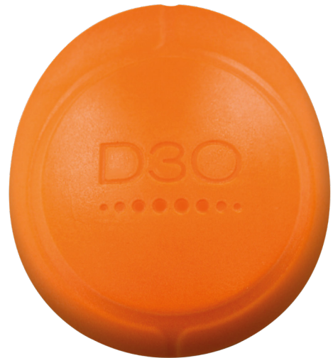
FITTED ANKLE GUARD LP