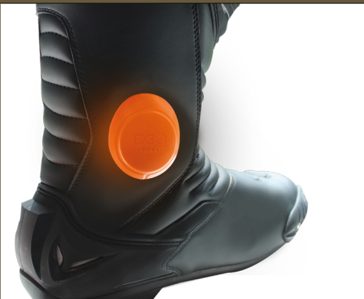
PASSES EN 13634: 2015 STANDARD WHEN INTEGRATED CORRECTLY INTO A HEAVY-DUTY BOOT